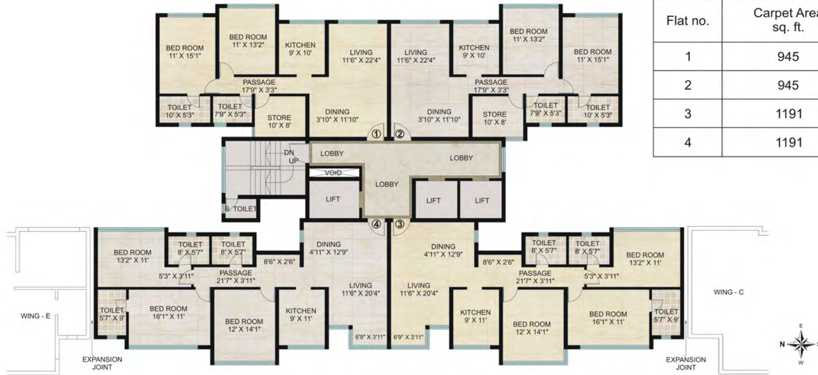
D WING FLOOR PLAN