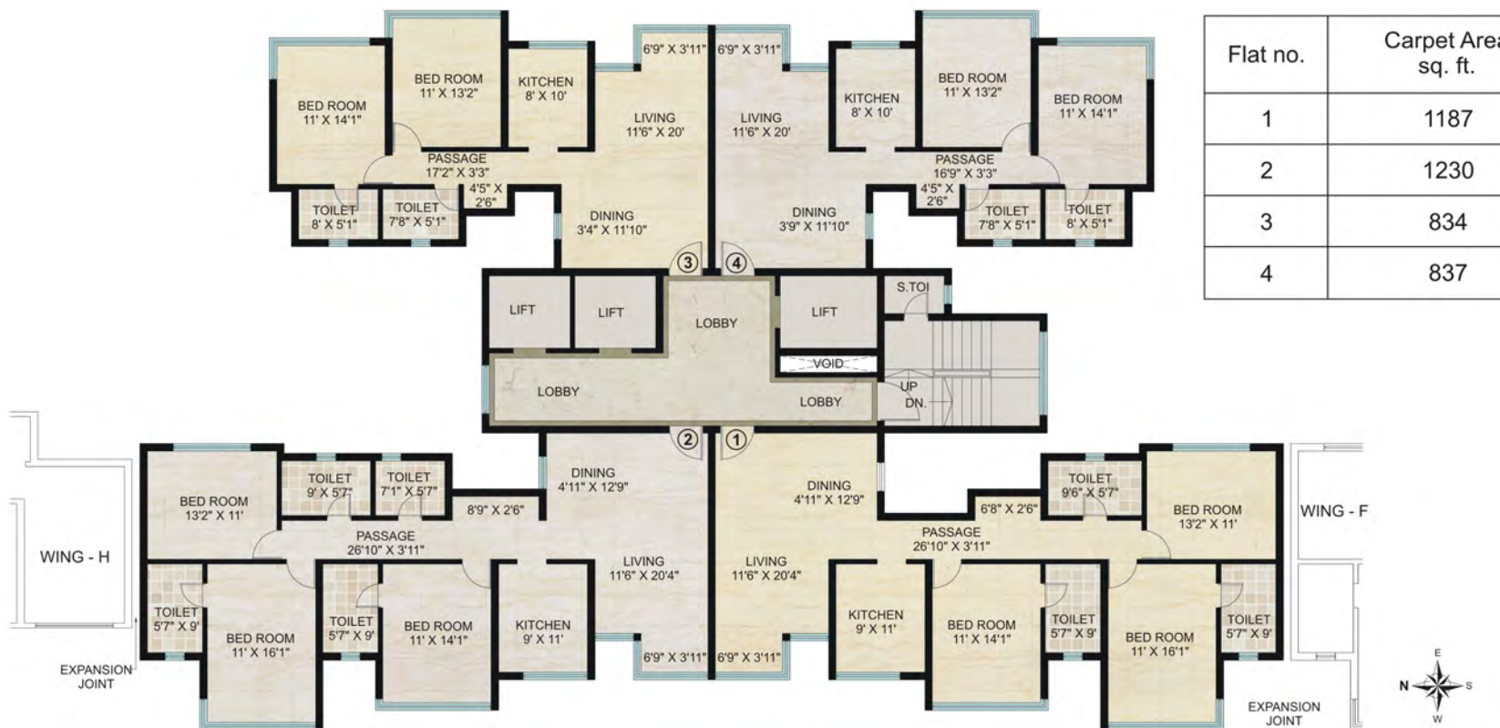
G WING FLOOR PLAN