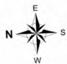
F WING FLOOR PLAN